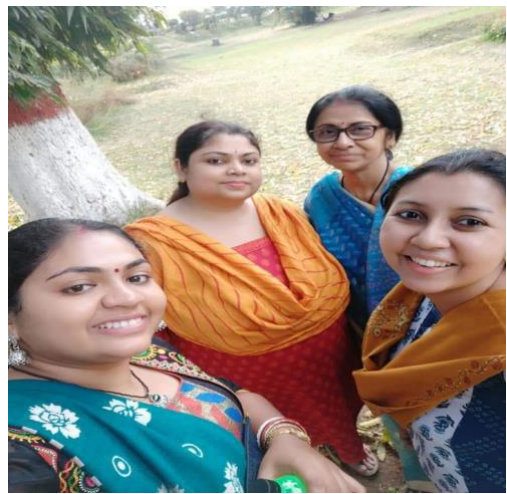
Teachers attending the picnic