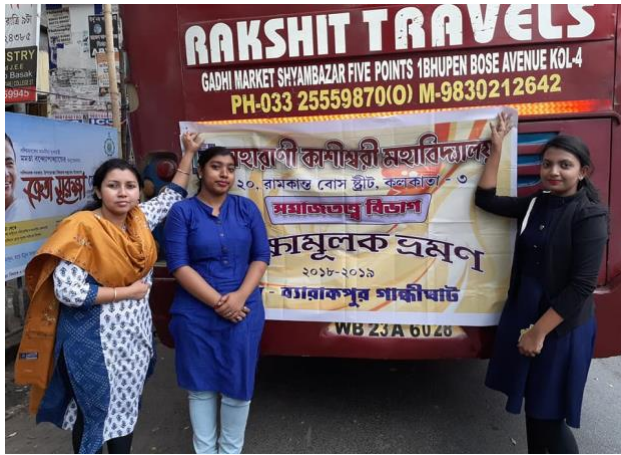
Head and students of the department