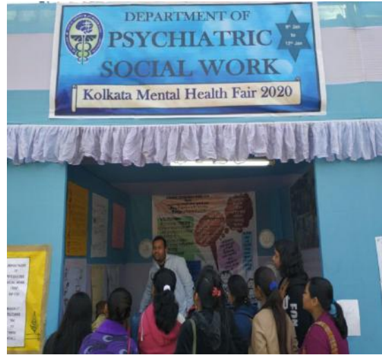
Students interacted with department of PSW at Mental Health Fair