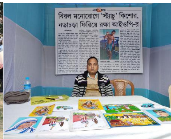
Students interacted with a person recovering from Schizophrenia