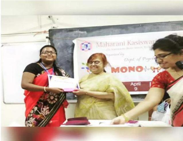
Alumni receiving certificate