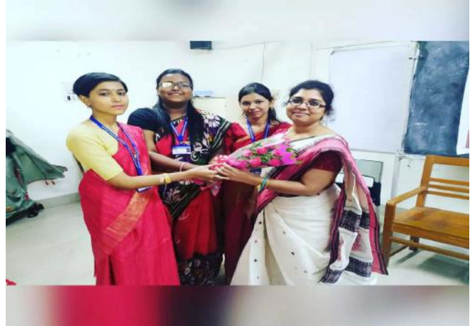
Students during the programe