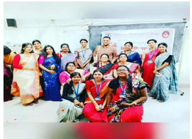
Departmental students with teachers