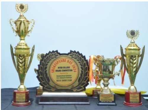
Prizes of the Drama Competition