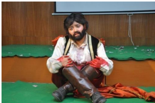
At the end the pathetic condition of Macbeth