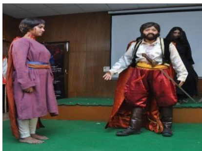
3 RD Apparition with Macbeth