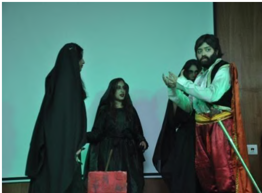
Macbeth With Three Witches