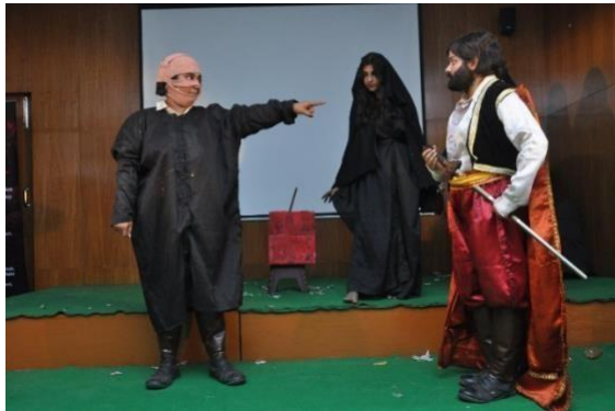
First Apparition with Macbeth