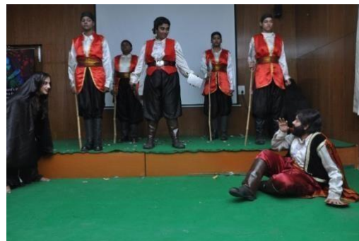
Macbeth with the ghost of Banquo