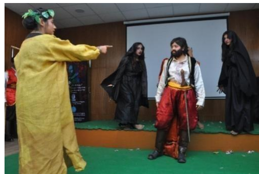
Second Apparition with Macbeth