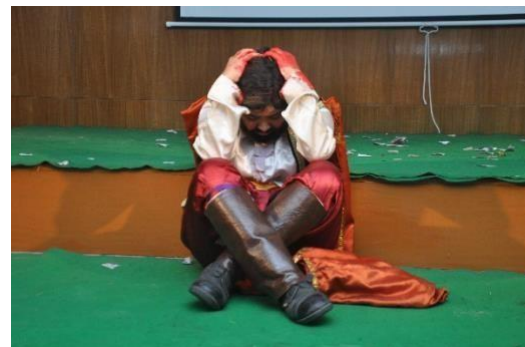
The End of he Drama (Macbeth)