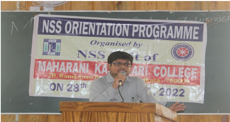
Organisation of Special Camp