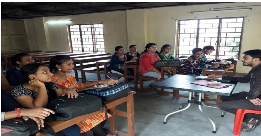
Spoken English Class