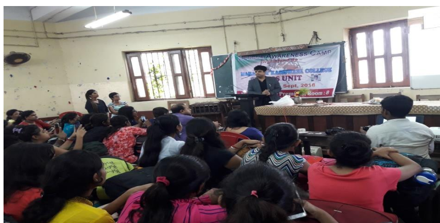
Dengue Awareness Programme