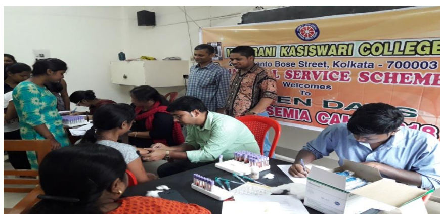
Thalassemia Testing Programme