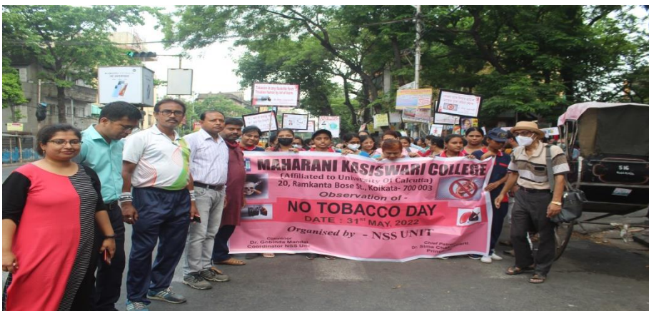
Observation of "Anti Tobacco Day"