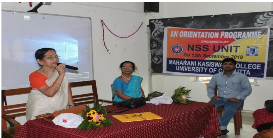
Awareness Programme - Visit to Inner Strength