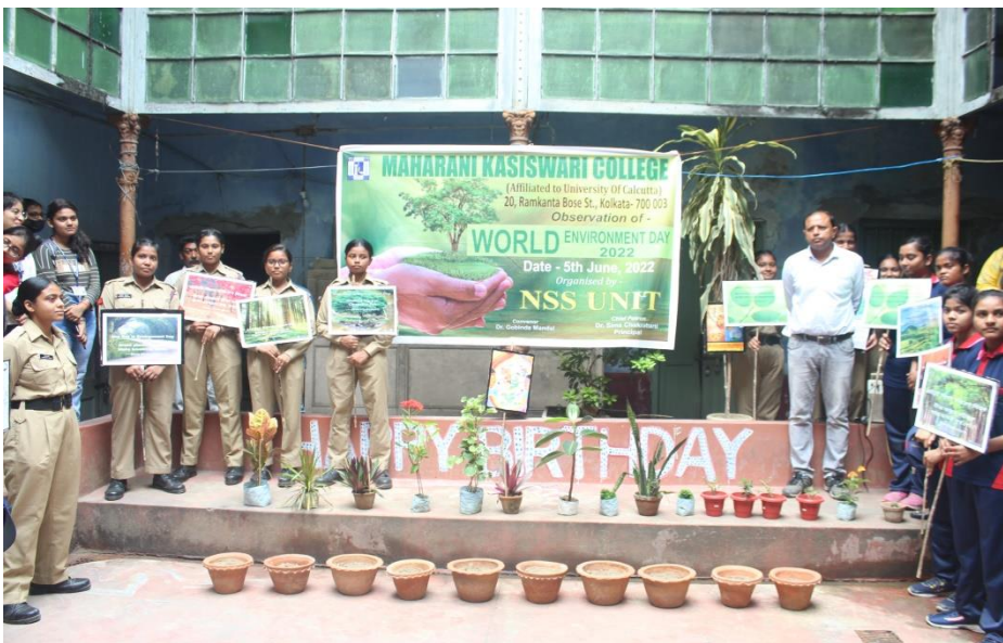
Observation of "Environment Day"