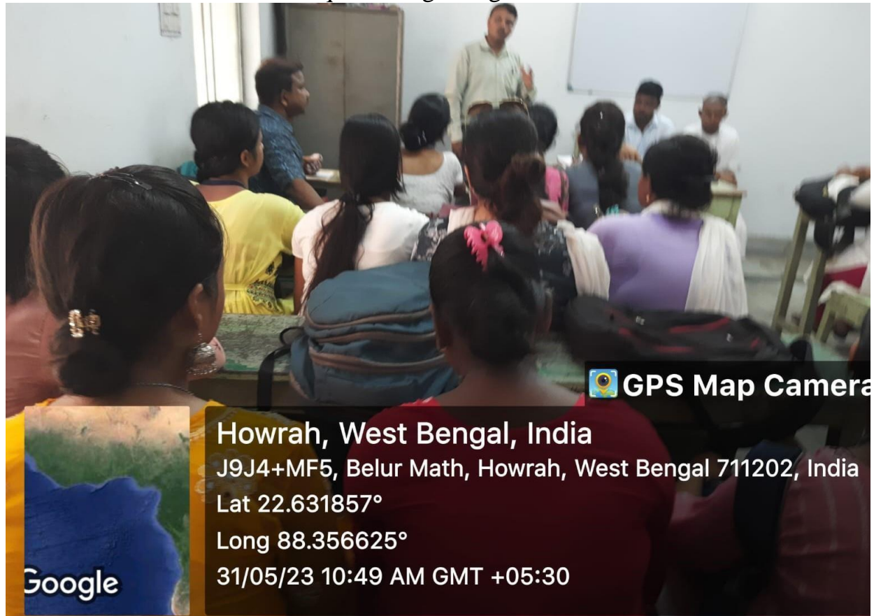
Figure 4: Students listening about traits in Jana Sikhon Kendra.

It was hot and sultry morning and students are observing each trait with patience. The mentor and instructor of various traits had given explanation and students of various traits show their practical knowledge in various traits. The students show enthusiasm and asked various queries regarding traits.