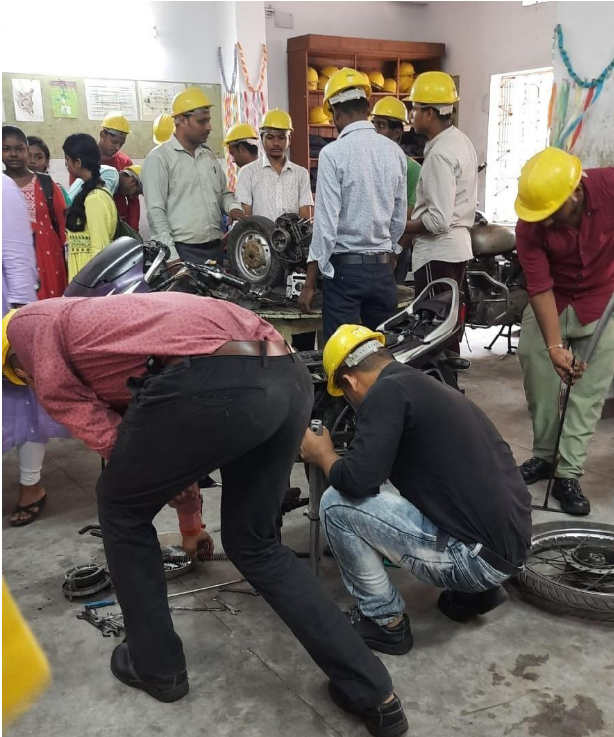
Figure 3: Students observing ongoing trait hand on practice in Jana Sikhon Kendra.

The traits are two wheeler repairing, television, computer ,LCD repairing, welding, A.C. repairing and various brands of mobile repairing.