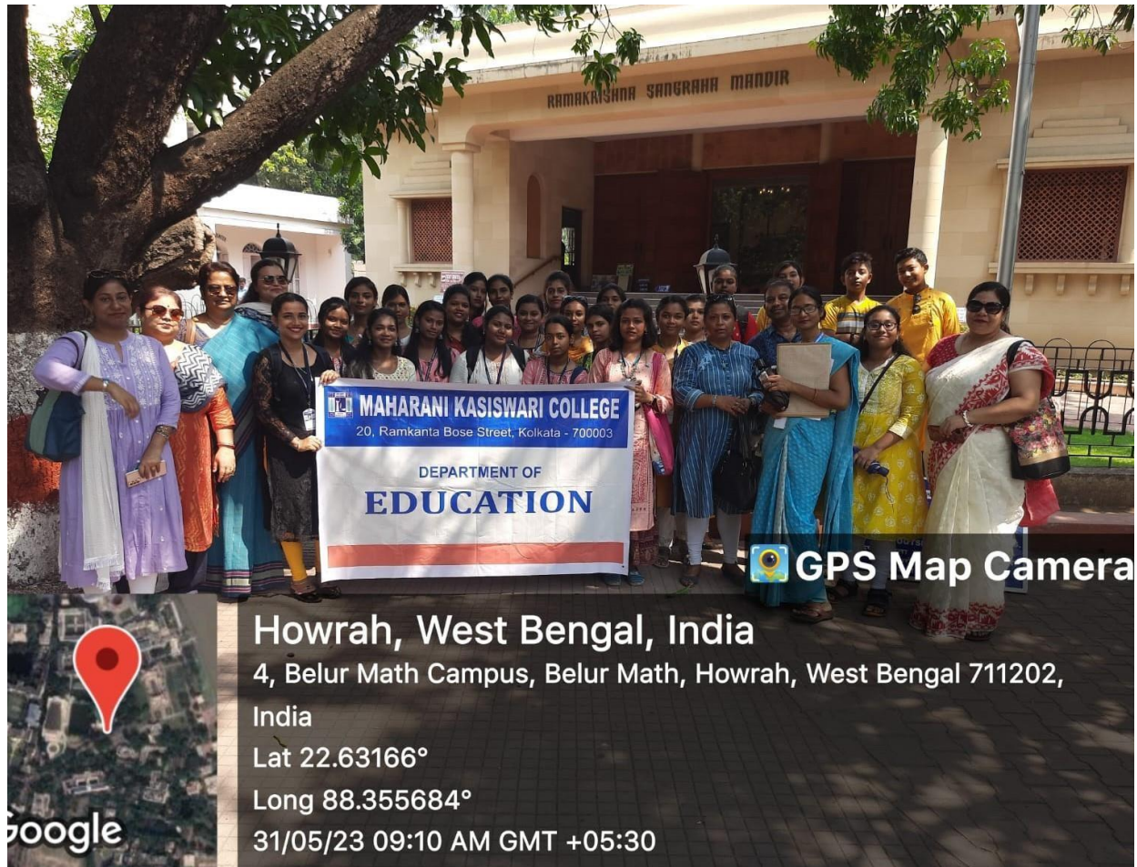
Figure 1: Students and Faculties in front of Ramakrishna Museum

A museum which had several articles related to Sri Ramakrishna and his disciples were stored. Then as earlier decided we all went inside and meet monk in charge and he had given free coupons to museum and token of prasada and little prasada to take home as blessings of almighty.