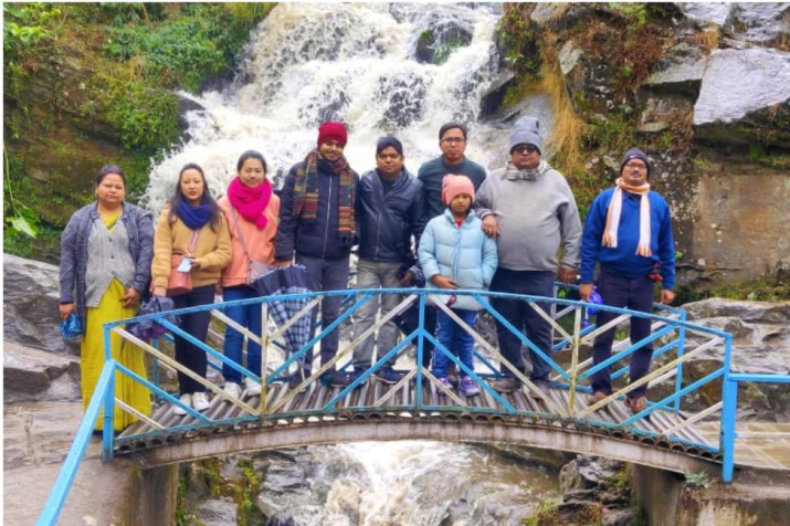
Teachers at Rock Garden, Darjeeling on 25.02.20