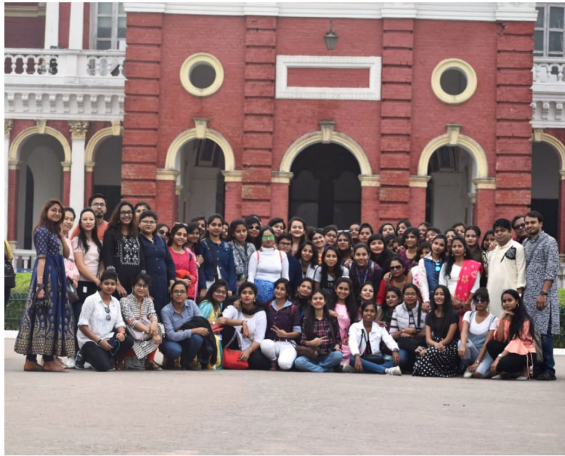
At Cooch Behar Rajbari on 20.02.20