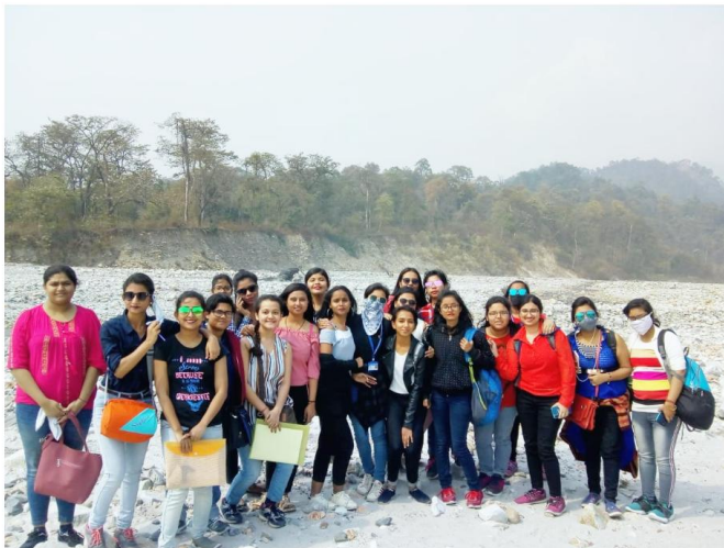
At Jayanti river, Alipurduar on 21.02.20