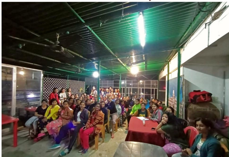
Educational discussion at Cooch Behar on 20.02.20