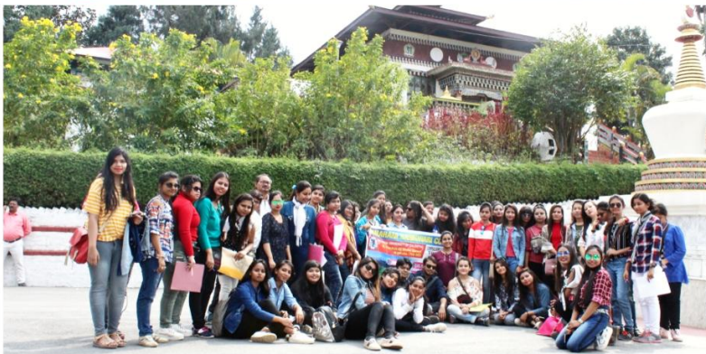
At Karbandi Monastery, Phuntsoling Bhutan on 22.02.20