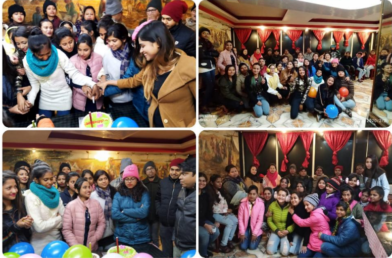
A small welfare celebration for 3rd year at Darjeeling on 25.02.20