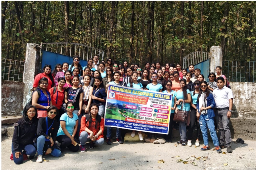
At Suntalekhola village on 21.02.20