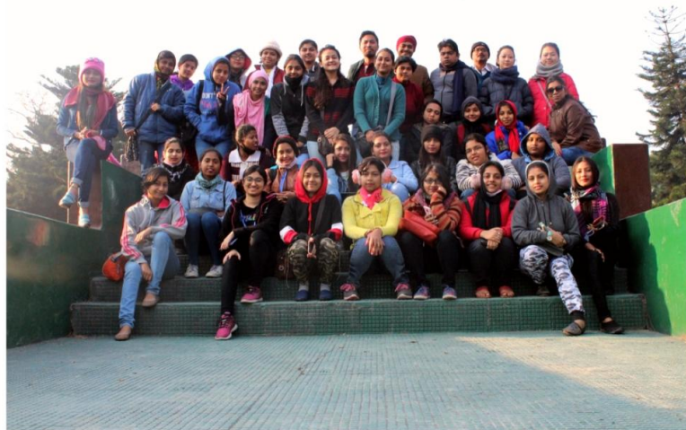
TTMV Department at Jaldapara National Park on 23.02.20