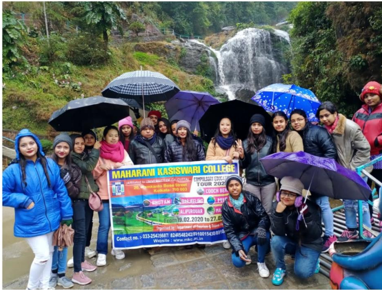
At Rock Garden on 25.02.20