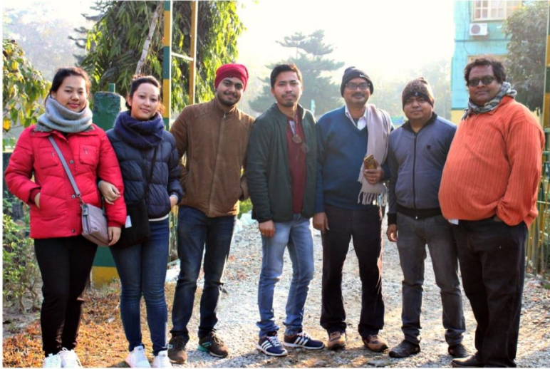
Teachers at Jaldapara National Park on 23.02.20