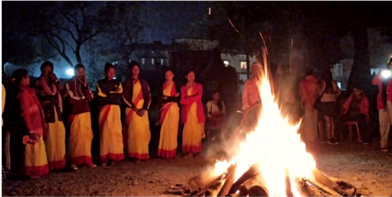
Rava Folk dance with campfire at Madari hat on 22.02.20