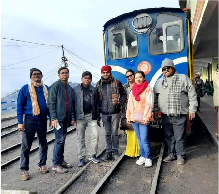
At Chum station, Darjeeling on 25.02.20