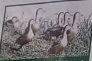
Lesser Whistling Duck