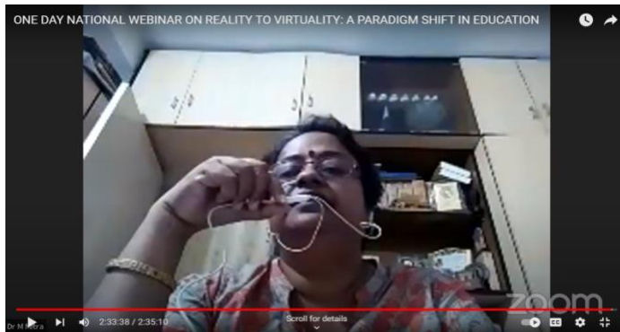
*Advisor & Senior Faculty member