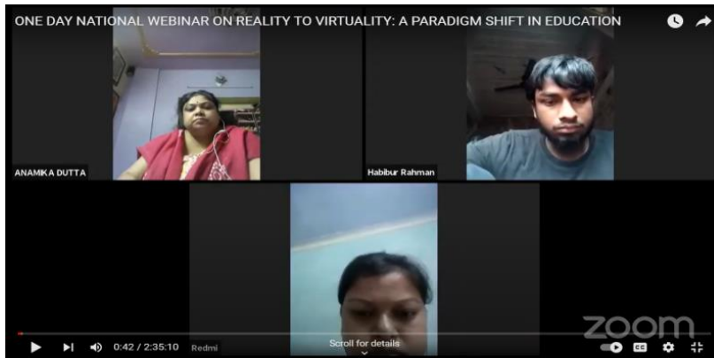
*Faculty member and participants