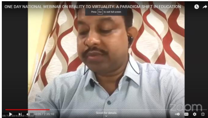
*IQAC Coordinator and H.O.D