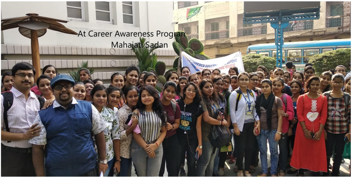
At Career Awareness Program Mahajati Sadan

Signature of the coordinator/organiser (College)