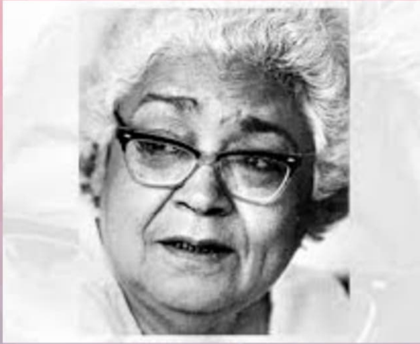
ISMAT CHUGHTAJ (1911-1991)